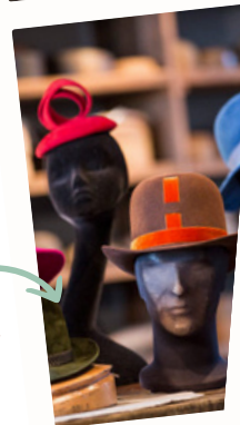
Musée du Chapeau